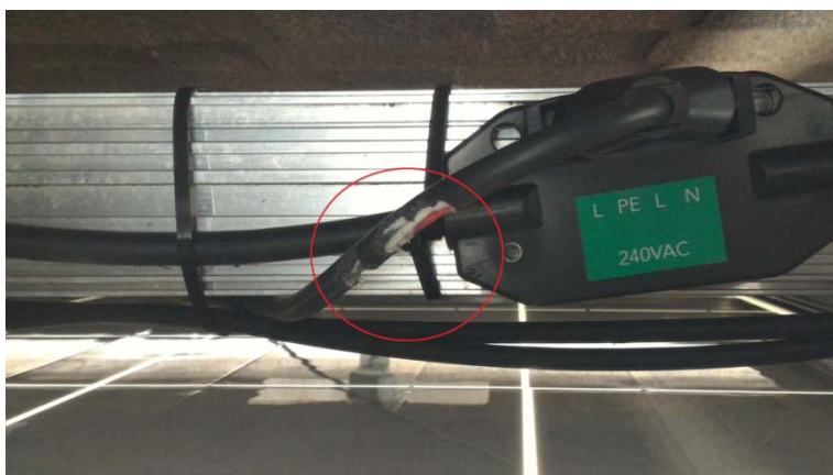
Photo B4 – Examples of acceptable screening for protection against rodents