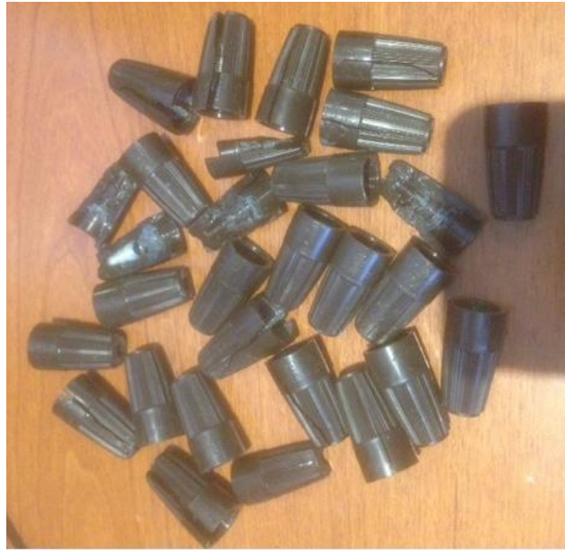
Figure F2 – Non-Petroleum based inhibitor failures