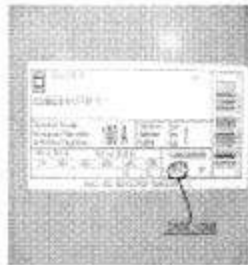
Combination Starter ( Date code location inside door )