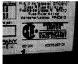
60A & 100A Safety Switches ( Date code location inside door )