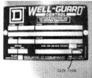
Well-Guard Pump Control ( Date code on door )