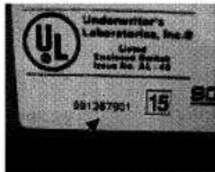
60A & 100A Safety Switches ( Date code location inside door )

The date of manufacture is marked on the product with date code (first 4 digits only) of 9845XXXX through 9947XXXX. The date code is marked on the outside of the carton near the carton label and on the product labels as shown below.