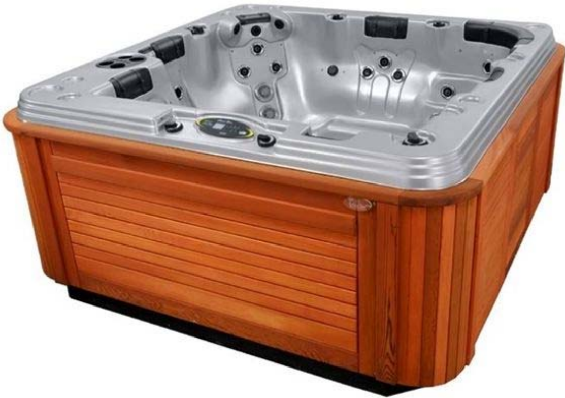
One of many different recalled Coast Spa models