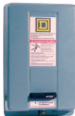
Typical enclosure design