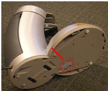
The location where to find the appliance type on the sticker.