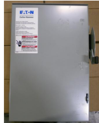
60A General Duty Safety Switch