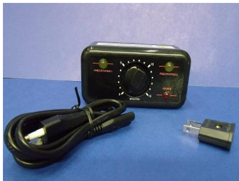
PR-1 Precipitator – Dual Voltage 110V with Case – Black with Silver Rods

Consumer Contact: Simple H2O 100 Hanlan Rd. Unit 13 Woodbridge ON L4L 4V8 Toll Free: 1-866-874-2532 Fax: 1-866-292-4710 www.simpleh2o.ca