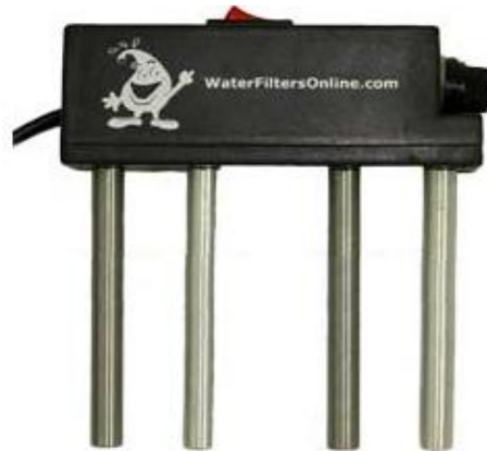
PR-2 Precipitator 2 – 110 Volt Compact Model with Case – Black with Silver Rods