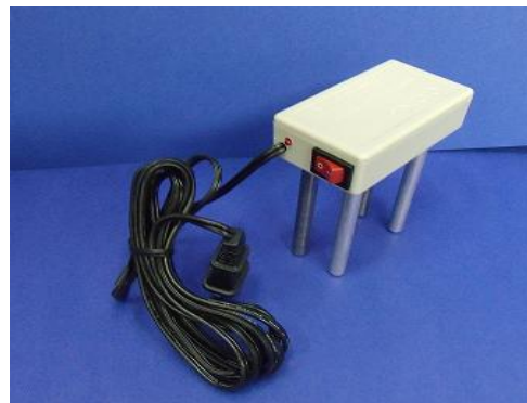
C.C.K- Electronic Dual Precipitator 110V – Model: DP-01 – Gray with Silver Rods