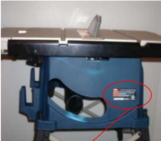
Table-Saw in Fully Assembled Form