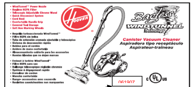
Carton Date Code

The six digits of the carton date code represent the Month, Day & Year of Manufacture (MMDDYY). All models with carton date codes for the years 2003, 2004, 2005, 2006, 2007 (last two digits are 03, 04, 05, 06, 07) are affected. Models with carton date codes for January through May 2008 are also affected (01DD08, 02DD08, 03DD08, 04DD08, 05DD08)