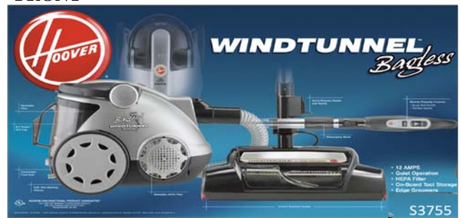
Model Number (S3755050)