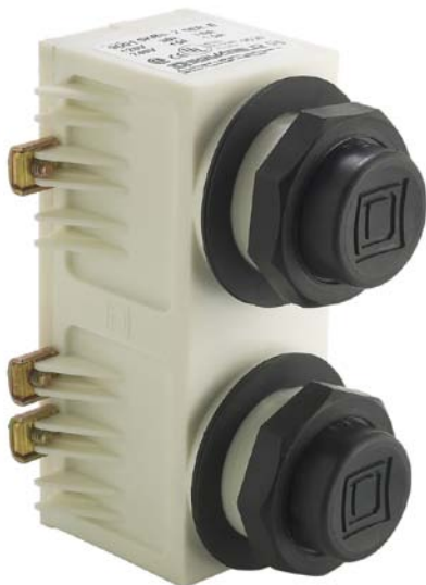
Type SKRU push button assembly

Remarks: The recalled units are certified to Canadian Standards by CSA. For more information about the CSA product certification process please visit: www.csa-international.org