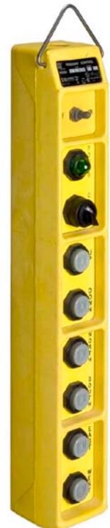
The SKRU pushbutton may be mounted in a SKYP pendant control station