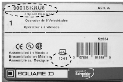
Carton label showing catalogue number and date code (1041)