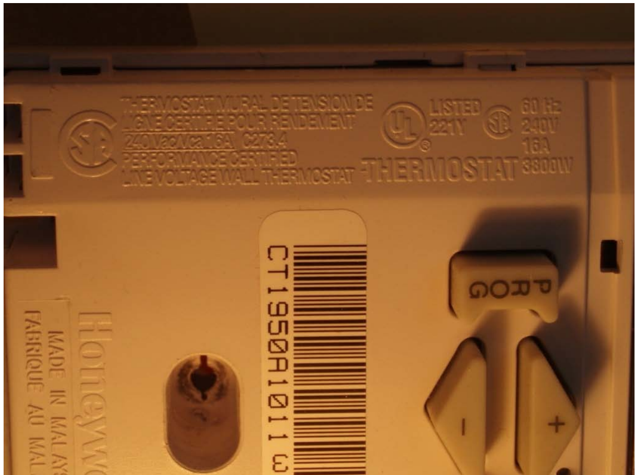
Photo of Certification Mark