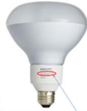
Model: EL/A R40 Dim 20W