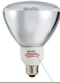
Model: EL/A PAR38 Dim 20W