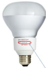
Model: EL/A R30 Dim 16W