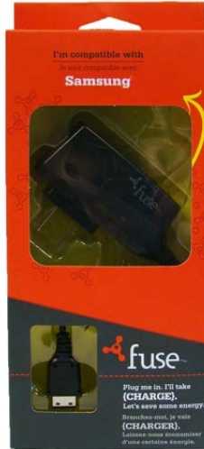
6786 Samsung Travel Charger