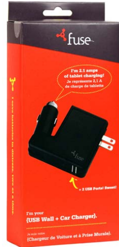
7206 2 in 1 Travel Charger