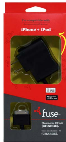
6225 iPhone Travel Charger