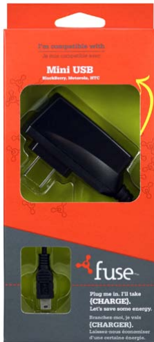
6788 Mini Travel Charger