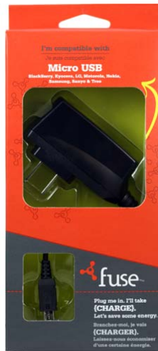
6789 Micro Travel Charger