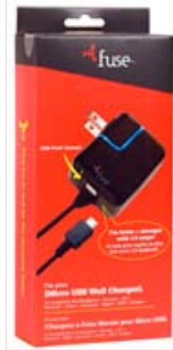
7212 Micro 1.5a Travel Charger