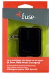
6776 Dual 120V Adaptor