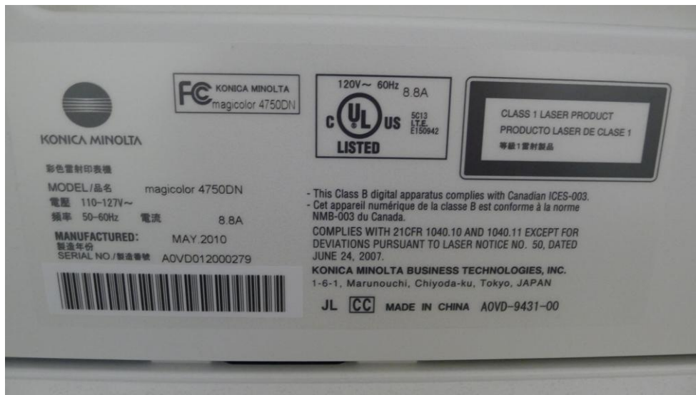
magicolor 4750DN Serial Number Label