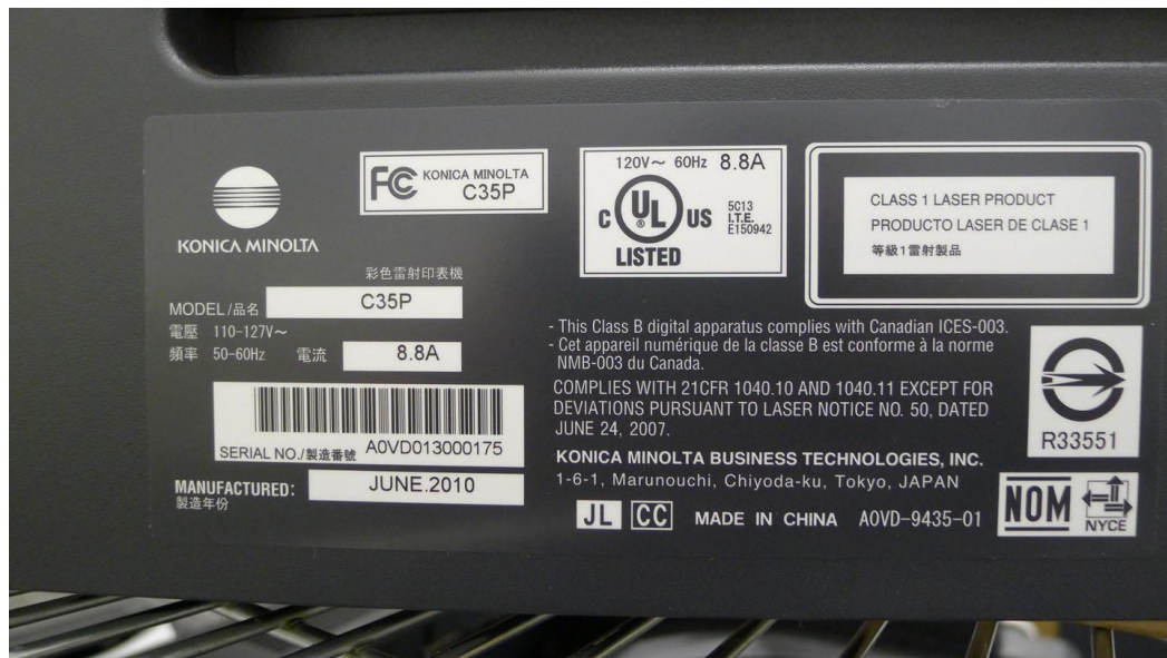
bizhub C35P Serial Number Label