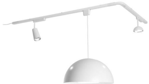
Example of the track in use