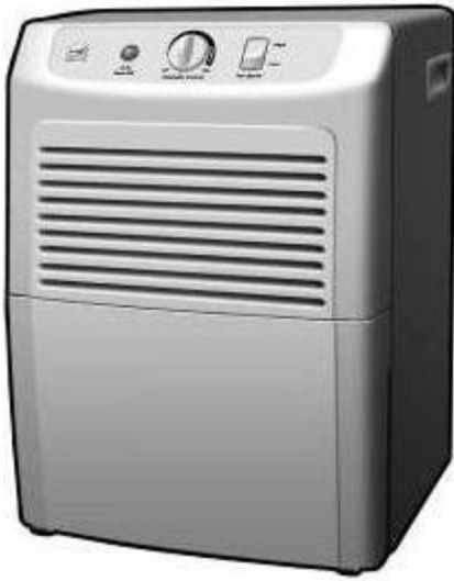
580.54351400 - 35-pint (2004)