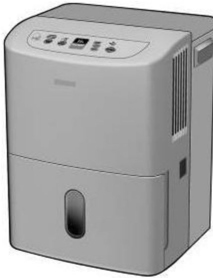
580.53509300 - 50-pint (2003) 580.53701300 - 70-pint (2003)