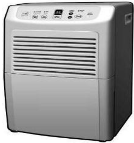
580.54701400 - 70-pint (2004) 580.54701500 - 70-pint (2005)