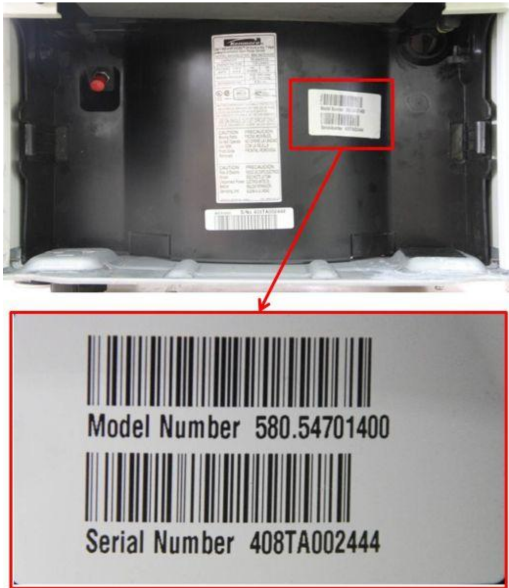
Location of model number for model numbers 580.54701400, 580.54351400 and 580.54701500