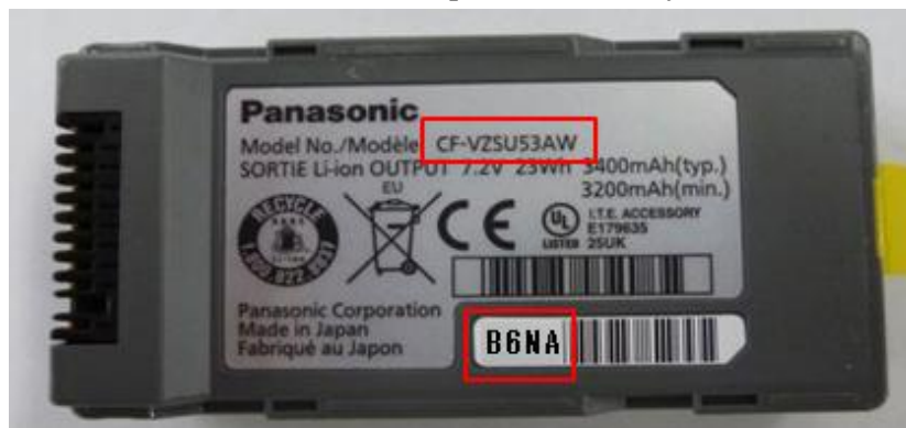
CF-VZSU53AW Replacement Battery Pack

Remarks: The recalled batteries are certified by UL. The CF-H1, CF-H2, and CF-U1 Toughbook Tablets are certified by CSA.