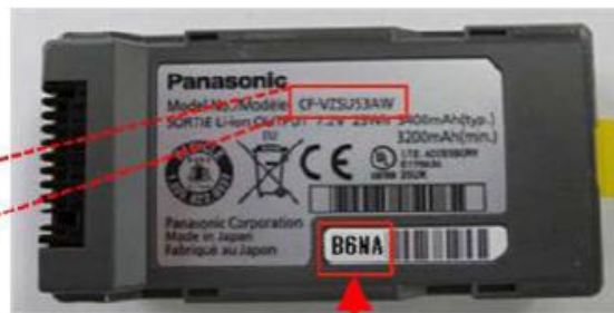
Manufacturing Lot Number (4-digit alphanumeric)