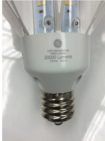
Date code location