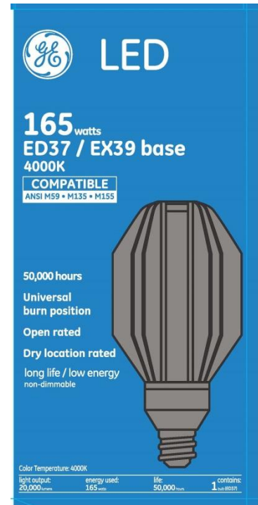
GE HID LED replacement lamp carton (front)