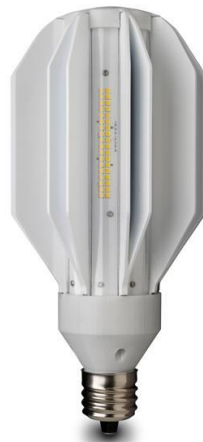
GE Lighting high intensity discharge (HID) LED replacement lamp

Remarks: These lamps are certified to Canadian Standards by UL. For more information about UL’s product certification process, please visit UL’s web site at: www.ul.com