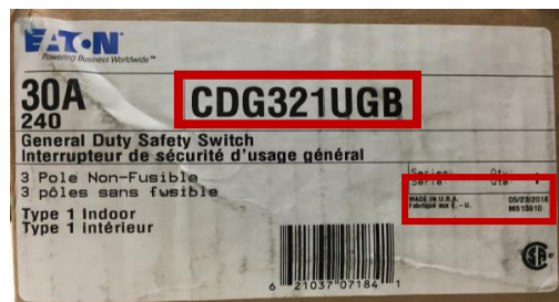
Catalog Number and Date code can be found from shipping label as above