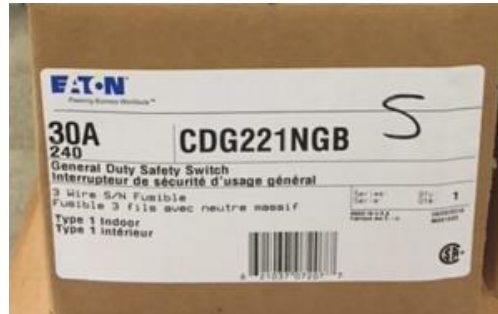
Figure 2. Identification of Conforming Switches manufactured 5/3/2016 – 7/19/2016. If any of the markings below are present on your product, no return or repair is required

Switch cartons with a written “S” adjacent to the catalog number are conforming product.