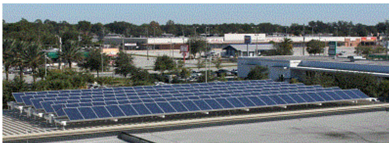
Photo of typical installation