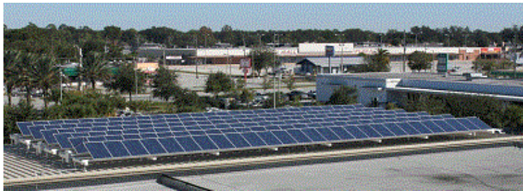
Photo of typical installation